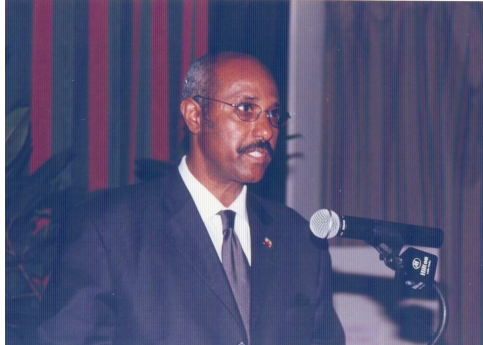
Foreign Minister Seyoum Mesfin Addressing Ambassadors of African Group

Minister of Foreign Affairs, Seyoum Mesfin said failing to find solutions for what has been happening in Somalia doesn't affect only the African region but also the entire international community.