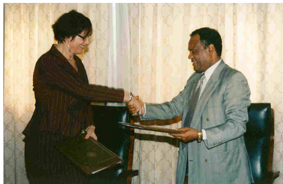
Signing the agreement