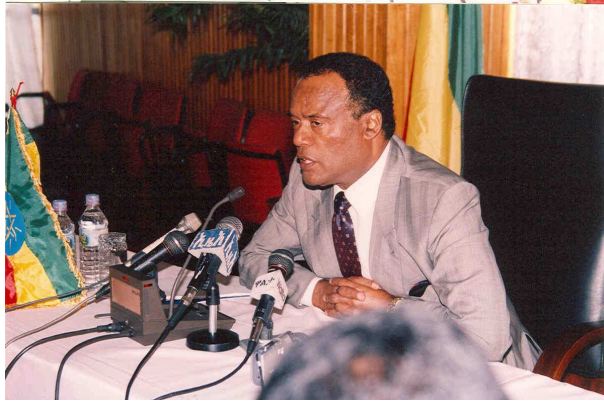
Dr. Tekeda Alemu

In an interview with local journalists State Minister of Foreign Affairs, Dr. Tekeda Alemu said that efforts were also made to help the Union of Islamic Courts develop the right attitude towards Ethiopia before they controlled Mogadishu.