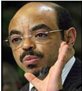
Prime Minister Meles Zenawi

Ethiopian Prime Minister Meles Zenawi has recently announced that Ethiopia needs partnership with the EU to support its programme of democratization and promotion of good governance.